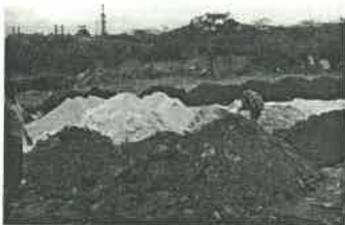
Indiscriminate disposal of hazardous solid waste by Chemplast out in the open

The IPT panellists inspected the site. One pit was partially filled with white lime-like sludge. It was open to the elements. What appeared to be plastic liners for the "landfill" were damaged, especially along the top compromising the integrity of the liner system. Holes in the liner allow water to enter the landfill, and leach the chemicals out of the stored sludge into the surrounding groundwater table.