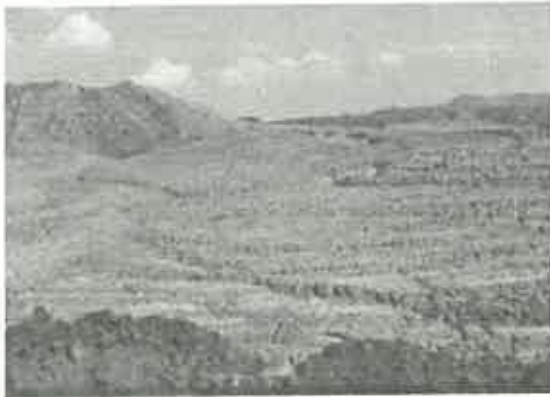
Red Mud dumping site of MALCO

During its visit, the Panel observed that Red Mud, in the form of a viscous sludge, was being trucked and dumped atop the existing dump. Entire hillsides are covered and filled with Red Mud. The sun-dried red mud is churned up as super-fine powder by the trucks or any passing vehicle. The panel noted that none of the workers or the drivers handling the waste had any form of protective gear except their own handkerchiefs.