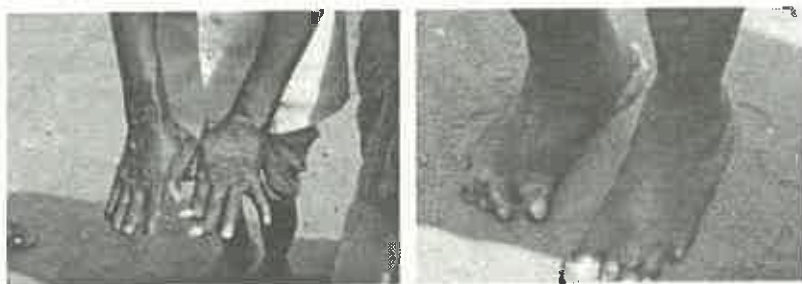
Severely deformed limbs of an ex-worker of the Chemplast

IPT entertained testimonials from several such workers, some of whom had visible and gross injuries as a result of historical exposure in the workplace. None of them reported to have been properly compensated or taken care of as per law. The workers seemed unaware that they have a right to compensation and lifelong treatment under the Employees State Insurance Act or the Workmen's Compensation Act.